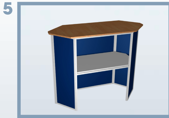
Place the counter on a level surface as possible and check the stability.