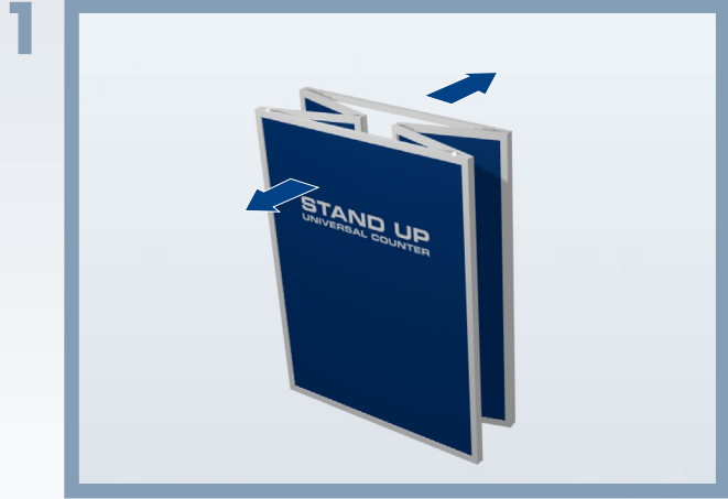
Take the frame out of the bag and fold out the back and front.