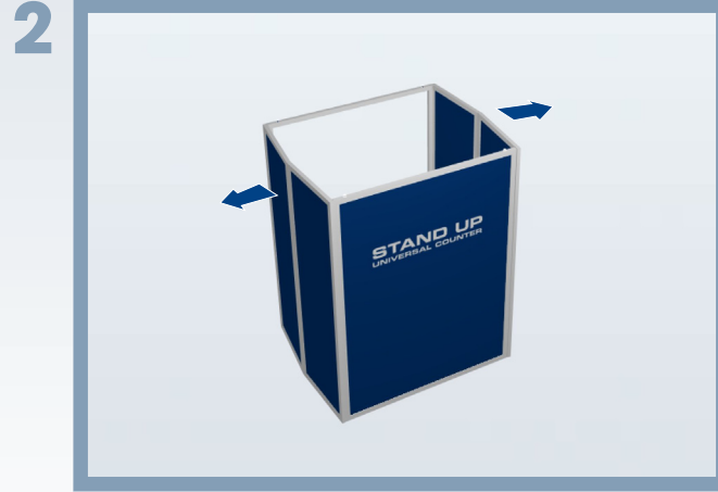
Continue to unfold the system by pushing the end sides outwards.